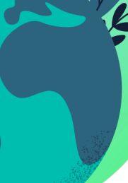
Constantinos Vargias GREECE